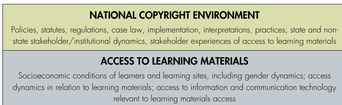
Figure 1: Constituent parts of the Copyright Environment & Access to Learning Materials